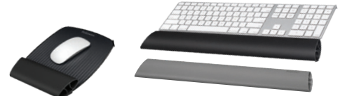
I-SPIRE SERIES™ Wrist Rocker™ and Keyboard Wrist Rocker™