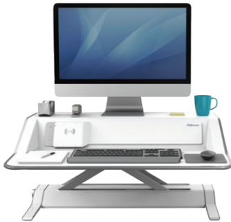
LOTUS™ DX Sit-Stand Workstation

Sitting for hours may feel productive but limited physical activity during the workday can drain your energy, morale and your performance. Go for a short walk or stretch. You can also use a standing desk in your home office to keep you moving.