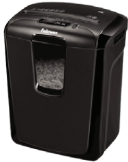
POWERSHRED® 49C 8-Sheet Cross-Cut Shredder Office Depot Item #: 1388179

The risks of identity theft remain even when you work remotely. If you're managing confidential documents from your home office, be sure to follow your company's document destruction policy. Cross cut and micro cut paper shredders provide the highest levels of security. Find one that fits your home office.