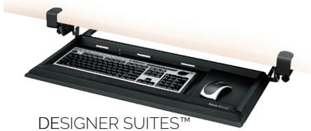
DESIGNER SUITES™ DeskReady™ Keyboard Drawer

When you're more comfortable, you're more productive, especially when it comes typing and mousing. Select an adjustable keyboard tray that accurately positions your keyboard and choose a wrist support to help prevent wrist strain.