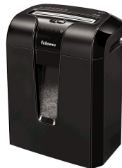
POWERSHRED® 62MC 10-Sheet Micro-Cut Shredder Office Depot Item #: 944822