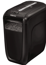
POWERSHRED® 60Cs 10-Sheet Cross-Cut Shredder Office Depot Item #: 303334