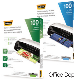
THERMAL LAMINATING Pouches - Letter Office Depot Item #: 795189 - Letter, 3 mil, 100 pack Office Depot Item #: 897497 - 5 mil, 100 pack