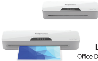
HALO™ Laminators Office Depot Item #: 2865388 - 95 Office Depot Item #: 7896700 - 125

If you laminate for company events, office signage or handouts, don't miss a beat in your laminating workload. Home laminators are compact and portable and provide high quality laminating results while saving space.