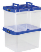
HEAVY DUTY Plastic File Office Depot Item #: 272060/594278