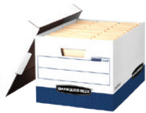
R-KIVE® HEAVY-DUTY Letter/Legal File Box, 12-Pack Office Depot Item #: 361427

A disorganized home office can impact your productivity. Take time to organize the documents you use every day. Bankers Box® gives you the flexibility to sort and stack your files to free up valuable workspace. Heavy-duty and portable, conveniently transport files from the office to home.