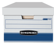
STOR/FILE™ BASIC-DUTY Legal File Box, 4-Pack Office Depot Item #: 329085