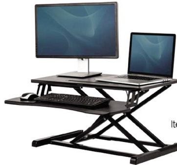
CORSIVO™ Sit-Stand Workstation